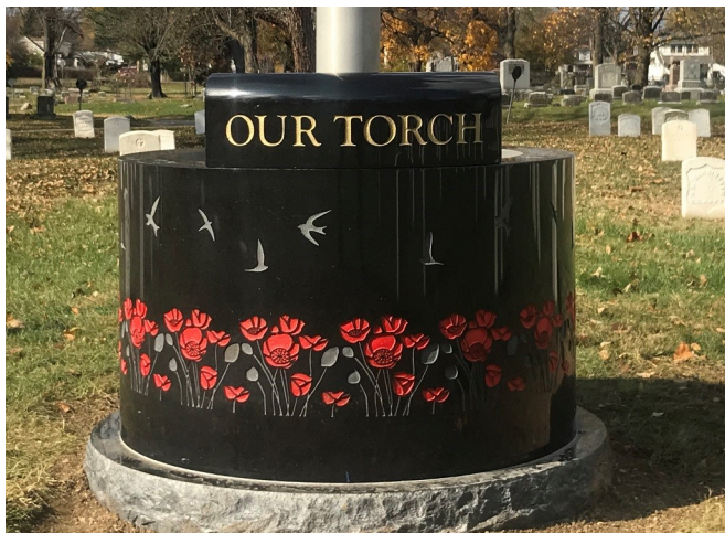
Made possible by your donations!

Canadian surgeon MAJ John McCrae wrote the poem after the death of a close friend in the Second Battle of Ypres, for whom McCrae had personally performed the burial service.