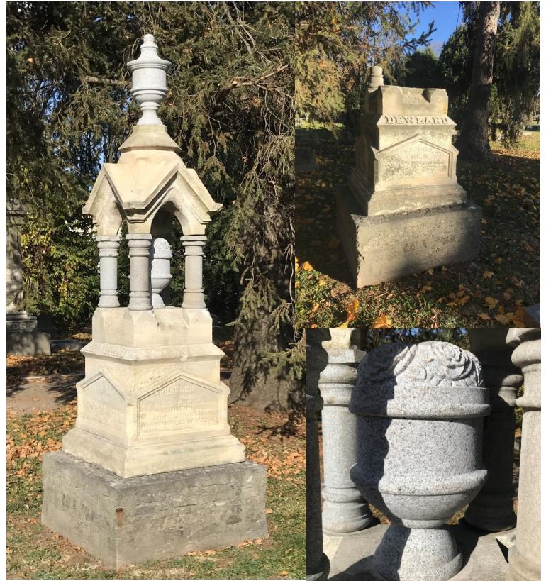
Clockwise from left: the restored monument, "father and son buried in a single grave"; "Before" photo; Detail of new vase, we had no idea what this vase looked like until we found an identical monument on the other side of the cemetery!

Green Lawn preserves many stories, at least so long as the monuments to each story endure, and restoring this monument preserves the story of the Sandy Run Train Disaster and the unique tragedy of a father & son locomotive crew.