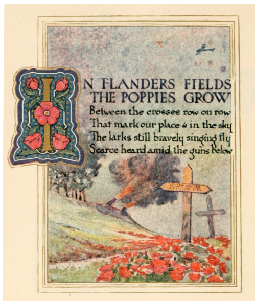
Illustrated page by Ernest Clegg - the words "grow" and "blow" are used in various versions of the poem, McCrae hand wrote "grow", but the first published version used "blow".