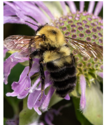
Two-spotted Bumble Bee