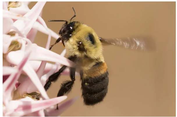
Brown-belted Bumble Bee