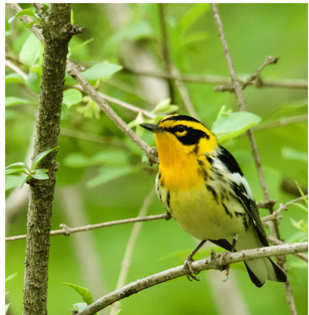
A migrating blackburnian warbler pauses near the waterfall at the pond. (Mike Gibbons)