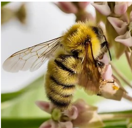
Yellow Bumble Bee