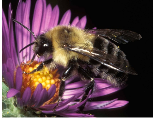
Common Eastern Bumble Bee

Each of these species are unique and important pollinators, and the information from this study will add to our knowledge of their abundance and health.