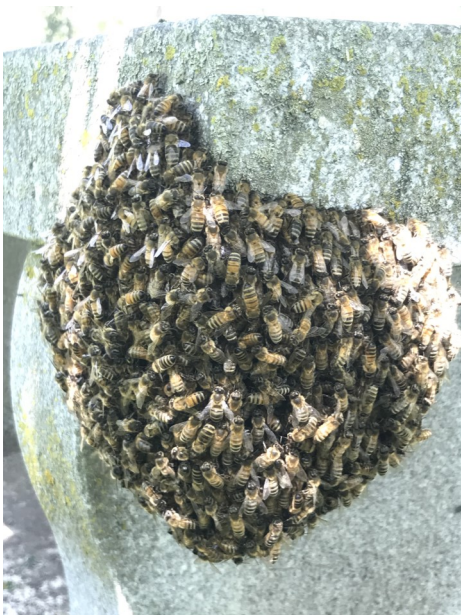
This swarm of honey bees was found near the pond and moved into one of the hives our local beekeeper maintains in the cemetery.