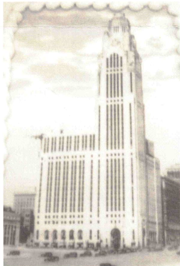
An image of the Leveque Tower as it appeared on a cake at the Columbus Bicentennial Party in February

Programs in July and August are planned for outdoors, but will be moved indoors.