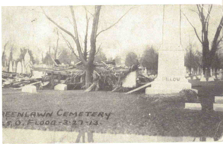
Flood of 1913.