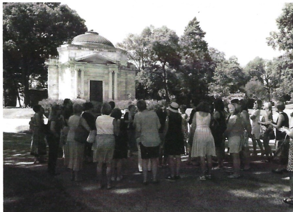
Doreen Uhas-Sauer leads the historical tour through Green Lawn Cemetery.